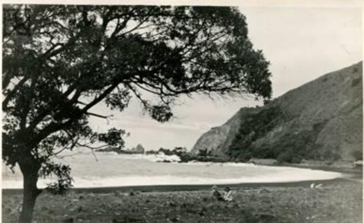
Goose Bay, Kaikoura Coast. N.Z.